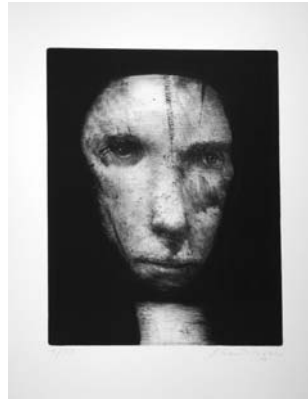
Alan Magee (b. 1947), Wound (Archive series) , 1995, printed 2004, giclée print on paper, H. 22 x W. 17 inches, James A. Michener Art Museum, Museum Purchase ©Alan Magee 2004